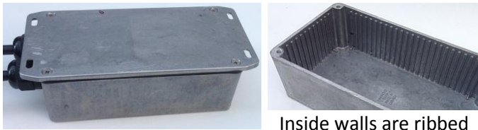
Inside walls are ribbed