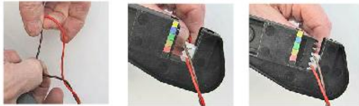
Trigger-pressure pushes the host wires firmly home into the splice to make a gas-tight connection.