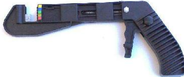
Putting a 3-way splice socket onto a pair of host wires

SuperSplice puts a set of mini sockets onto the host circuit. You connect your wires to the SuperSplice plug and just plug it in.