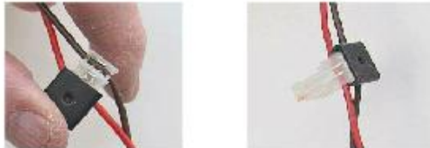
A neat plug is formed