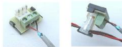
Your new, pluggable connection is made.