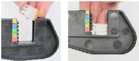
Insert the splice socket into the tool and push it to the bottom